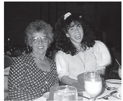
Thank you, Mom!!

I want to thank my mom for everything she has done. Thank you, mom, for believing in me and standing by me when others turned aside.