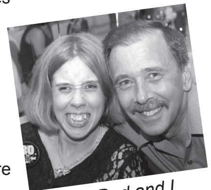
My Dad and I

I don't think parents put their kids into an institution by choice. I think they just don't have enough information and support. I wouldn't blame any parent for the choices they had to make. I would just encourage people to help each other and be creative. Look for the best in life! ... And I would share the lessons I've learned from my family!