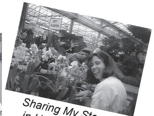
Sharing My Story in Holland, 1998