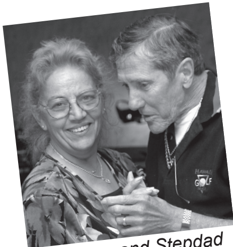
My Mom and Stepdad