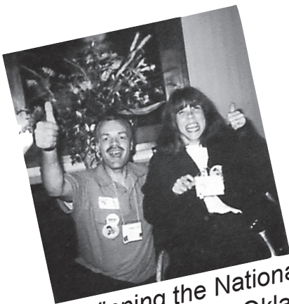
Winning the National Conference Bid in Oklahoma

And to everyone who reads this, remember that we are all in this together!