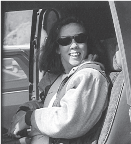
At the International SA Conference in Alaska

Today I can't believe how busy my life has become! I work for Advocates in Action. That is Rhode Island's statewide Self-Advocacy organization. I travel throughout the state, across the country and even around the world to share my life's story. I also speak about issues that affect people who have a disability and things that we can do about them.